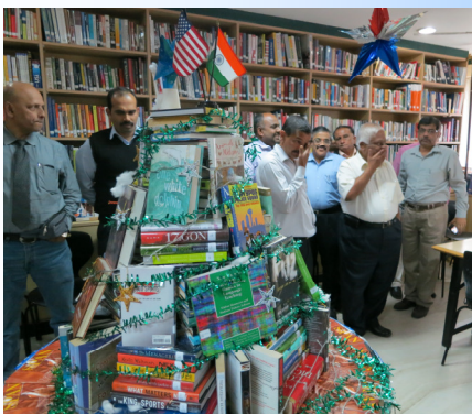
Chairman and faculty members welcoming New Year 2015 at American Corner on 1st January 2015