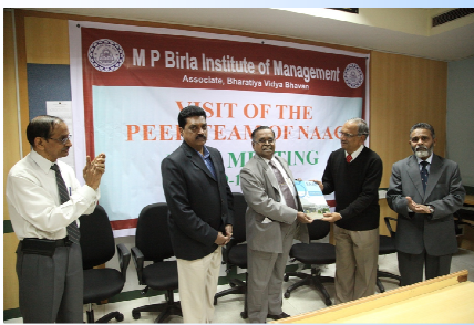
NAAC Peer Team at MPBIM