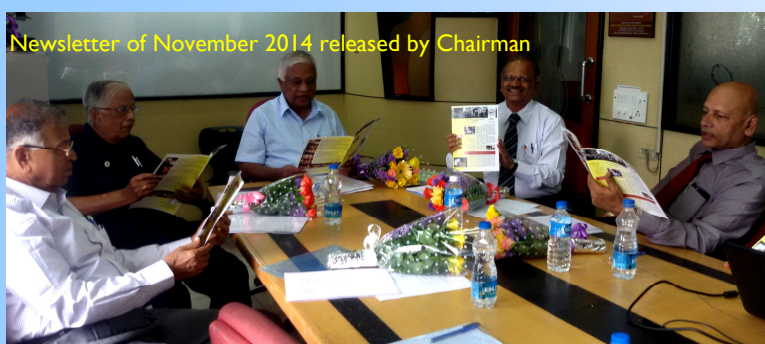
Newsletter of November 2014 released by Chairman