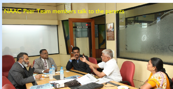
NAAC Peer Team members talk to the parents