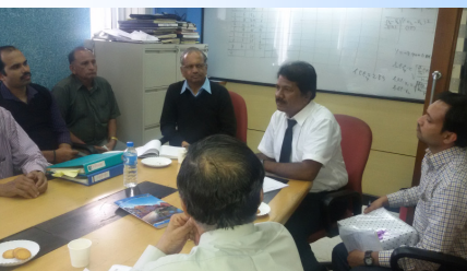
ISO Surveillance audit at MPBIM